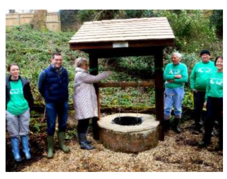
Cutting The Ribbon